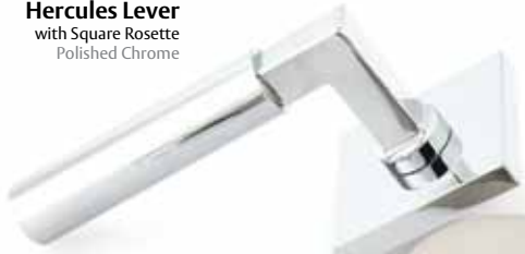
Hercules Lever with Square Rosette Polished Chrome