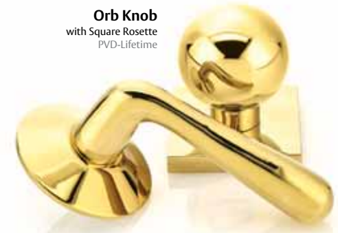
Basel Lever with Modern Rosette PVD-Lifetime