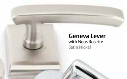
Geneva Lever with Neos Rosette Satin Nickel