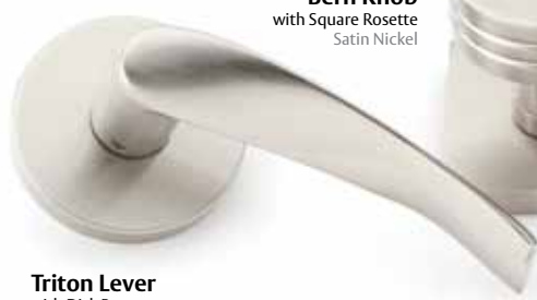
Triton Lever with Disk Rosette Satin Nickel