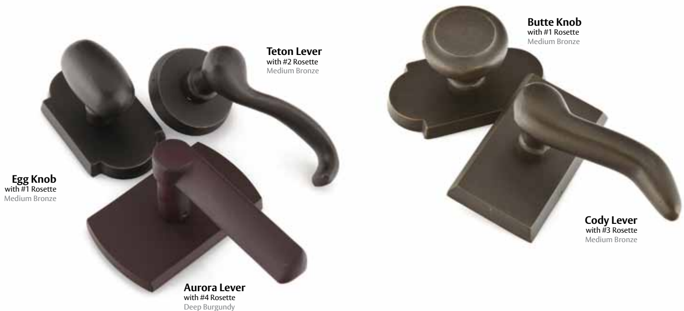
Egg Knob with #1 Rosette Medium Bronze