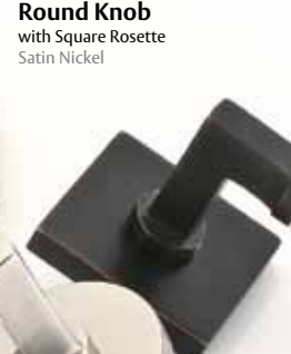
Round Knob with Square Rosette Satin Nickel