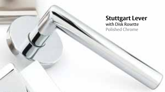
Stuttgart Lever with Disk Rosette Polished Chrome