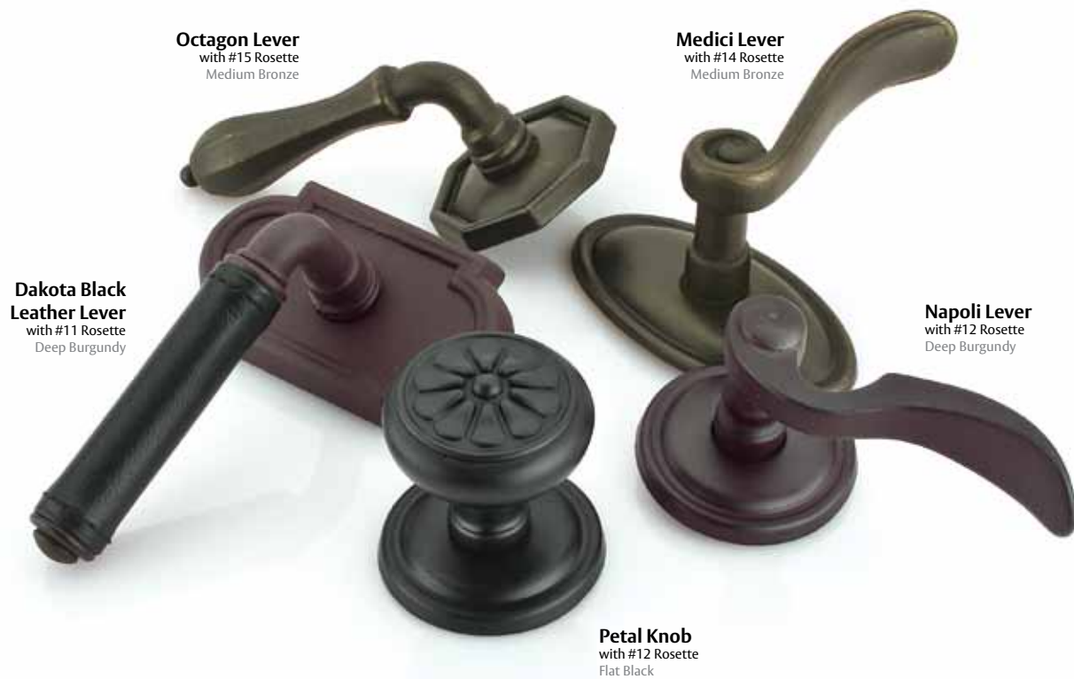
Octagon Lever with #15 Rosette Medium Bronze