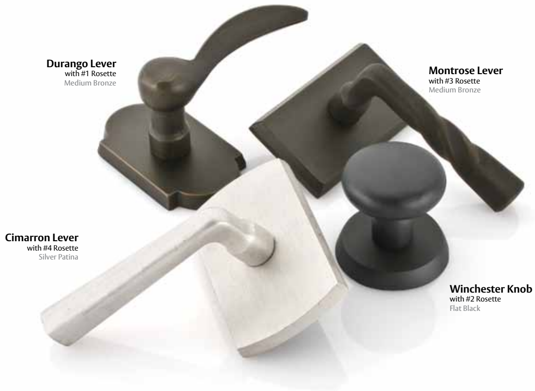
Durango Lever with #1 Rosette Medium Bronze