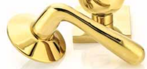
Basel Lever with Modern Rosette PVD-Lifetime