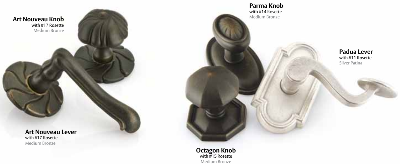
Art Nouveau Knob with #17 Rosette Medium Bronze