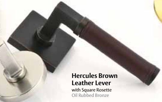
Hercules Brown Leather Lever with Square Rosette Oil Rubbed Bronze